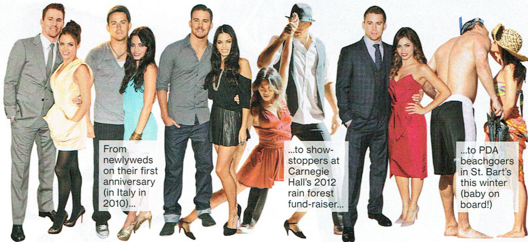
From newlyweds on their first anniversary (in Italy in 2010)...

You can't even hate them for it. Observe the Tatum's' evolution.